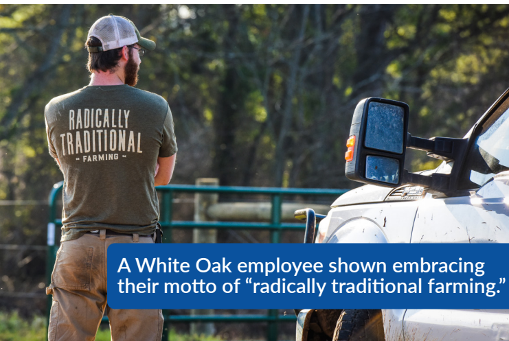
A White Oak employee shown embracing their motto of "radically traditional farming."